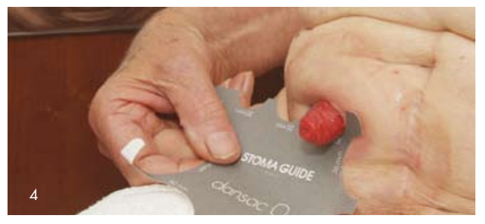
If needed use the stoma measuring guide to determine the size of your stoma.

It is important to be prepared and have all the equipment you require at hand before starting your urostomy care. You may wish to carry out the procedure in the morning before eating or drinking.