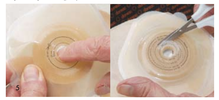
If the stoma is uneven or oval, adjust the hole in the pouch skin barrier with small, sharp scissors or use the tip of your finger to even the hole to the correct stoma diameter. Remember it is important that the hole fits your stoma snugly without applying any pressure.

Gently remove the used pouch. Remember to empty the pouch before you start. As an added precaution to avoid spillage, you can place a disposable plastic bag in your waistband.